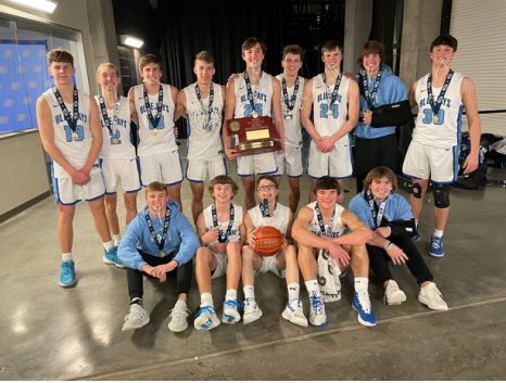
C-1 Boys Basketball